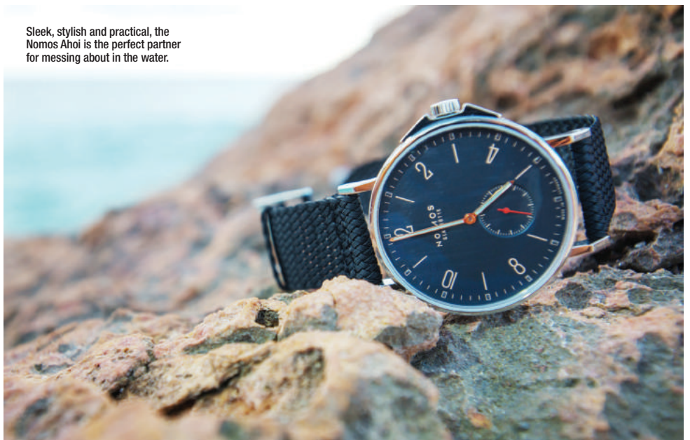
Sleek, stylish and practical, the Nomos Ahoi is the perfect partner for messing about in the water.

Being at the top of the food chain, sharks are a bellwether of an ecosystem’s health and vital to maintaining it. They are also a star attraction for divers. St Maarten recognised this and designated the waters around the entire Dutch coastline a marine park, prohibiting fishing, a move that makes the island one of the Caribbean’s best kept dive destination secrets.