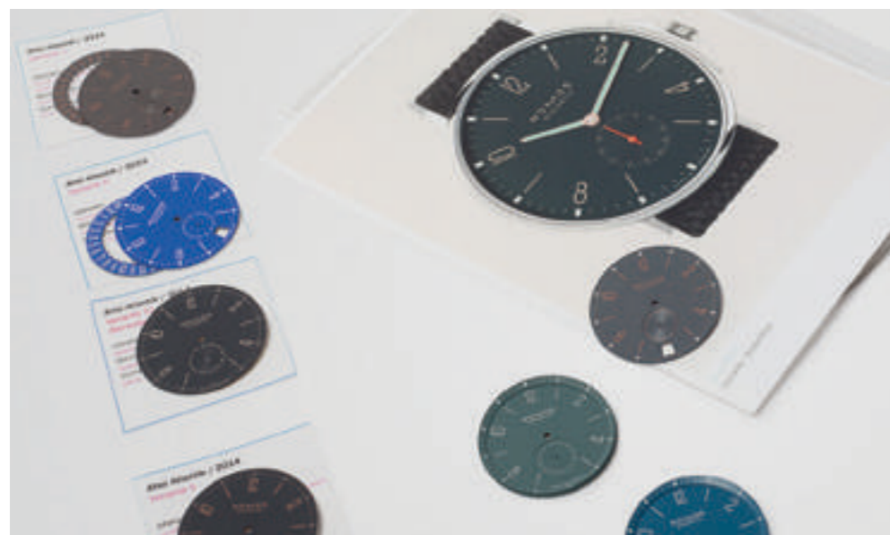
The use of colours is a Nomos speciality

horlogerie by combining traditional craftsmanship and clear design and by aiming to make the best possible watch and selling it at a reasonable price. This way of working corresponds with the principles of the Deutscher Werkbund, a design movement which, like Bauhaus and the Ulm Design Academy, fits in with a rich German design tradition.