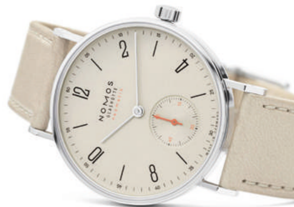
Tangente neomatik champagner

The space is large, tall and light. You could say that at Berliner Blau - the name of the creative agency that is part of Nomos Glashütte and works exclusively for the watch maison - the interior looks like a Nomos watch; orderly, efficient, well-thought-out. Unsurprisingly, the Greek word 'nomos' means order and a fair division. Since its establishment in 1992 Nomos has been making a name with watches that do more than just display the time in a strictly ordered manner. Nomos does what its name stands for, and has 'democratised' haute