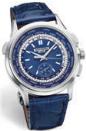
Patek Philippe Ref. 5930G World Time Chronograph

high-end brands, models, technology and design