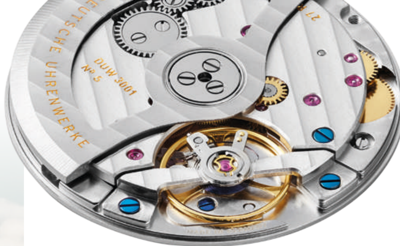
The new in-house DUW 3001 calibre from Nomos Glashütte is a sexy slim movement