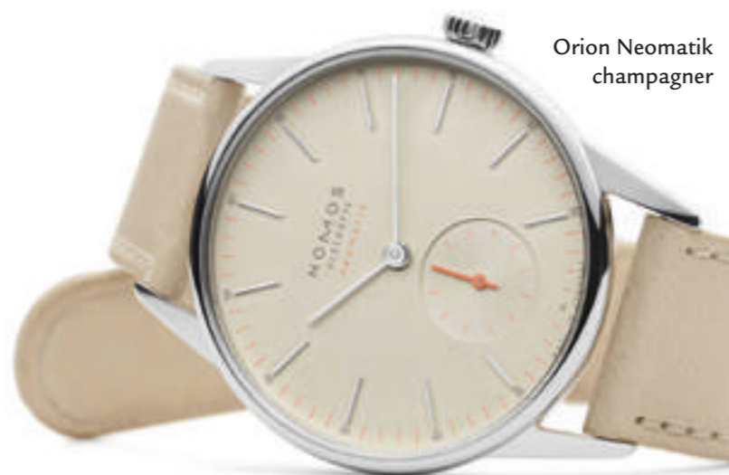
Orion Neomatik champagner

Apart from the aesthetics, in 2016 Nomos is also showing itself to be a leading movement specialist. The calibre DUW 3001 displays the company's unique technical abilities with strong democratic values. The combination of movement tradition from Glashütte, the 'Fingerspitzengefühl' of the creatives in Berlin and a philosophy that, among other things, aims for attainable quality, will be going far. Nomos' split personality works smoothly and delivers unique results. ■