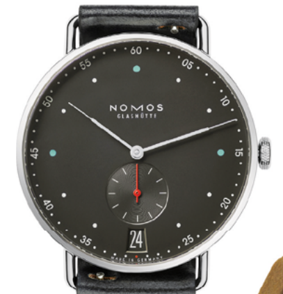
METRO 38 DATUM IN STAINLESS STEEL, £2,200, NOMOS GLASHÜTTE , AS BEFORE