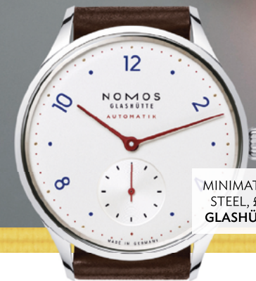
MINIMATIK IN STAINLESS STEEL, £2,600, NOMOS GLASHÜTTE , AS BEFORE

'A visit to Teufelsberg, with the old US Army base at the top of the hill, and then going for a swim in the Teufelssee lake. It's only a short drive from central Berlin so it's easy to do in a day.'