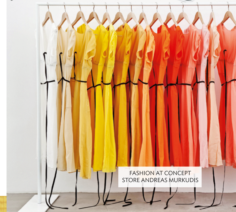
FASHION AT CONCEPT STORE ANDREAS MURKUDIS

'Definitely the concept store Andreas Murkudis on Potsdamer Strasse. It has the best selection of fashion and accessories in the city, as well as the new C/O Berlin gallery, which recently relocated to Amerika Haus and shows the perfect mix of work by young up-and-coming photographers and established names including Annie Leibovitz and Peter Lindbergh.'