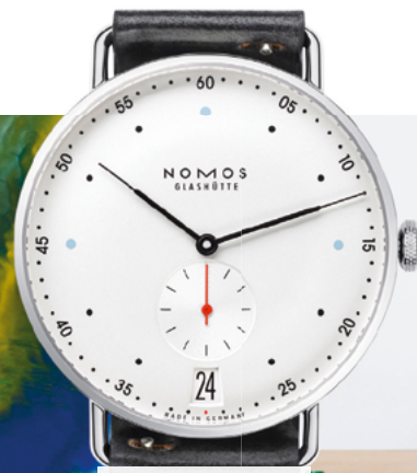
METRO 38 DATUM IN STAINLESS STEEL, £2,200, NOMOS GLASHÜTTE (WWW.NOMOS-GLASHUETTE.COM)