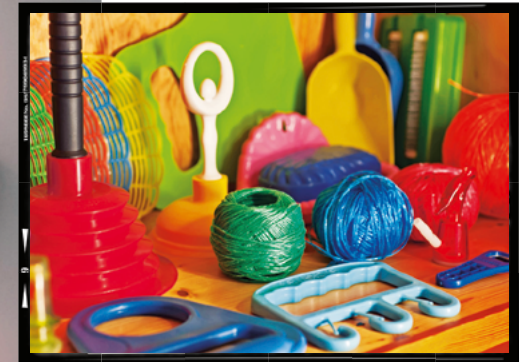
BELOW, DETAIL OF A DISPLAY AT THE MUSEUM DER DINGE